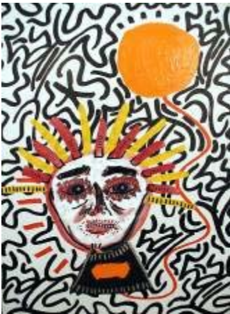
Balloon, 2000, acrylic with paint marker on canvas, 24 x 18 inches, (collaboration with Paul Kostabi )