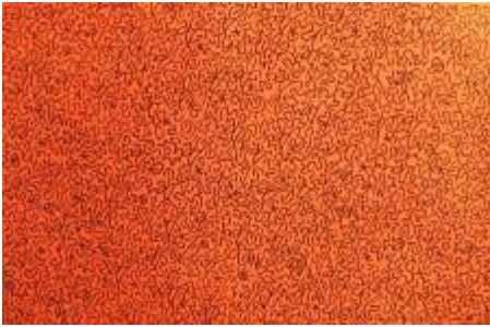
Orange, 2000, acrylic with paint marker on canvas, 24 x 36 inches