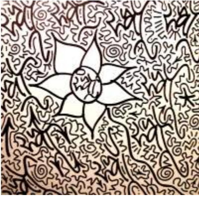
Mr. Sunshine, 2004, paint marker on canvas, 20 x 20 inches