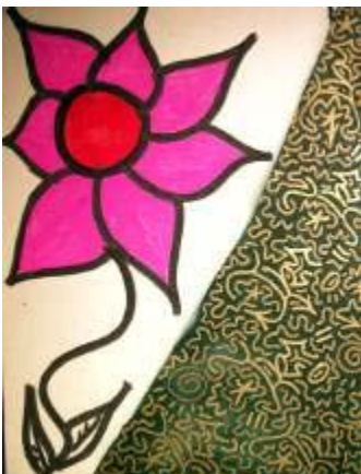
Flower, 2000, spray enamel with paint marker on canvas, 24 x 18 inches