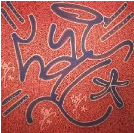
Splat, 2004, spray enamel on canvas, 40 x 40 inches.